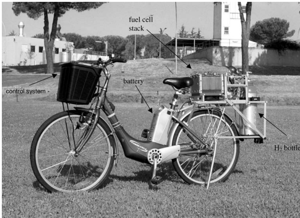
Fig. 1. The H 2 bicycle.