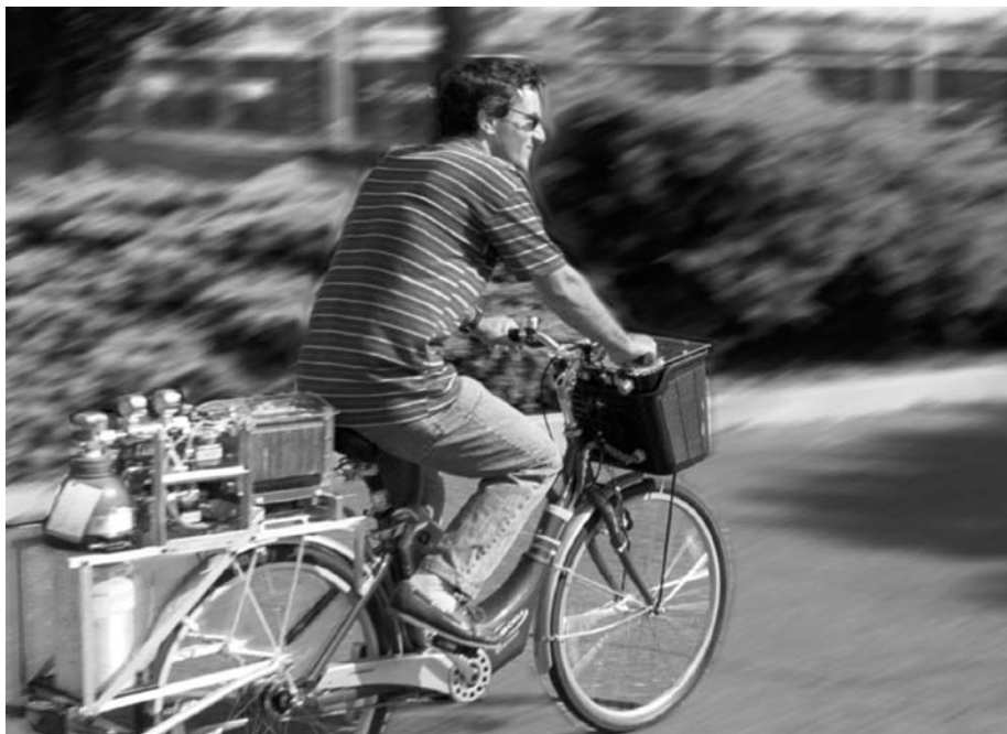
Fig. 4. Bicycle during road test.